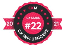
Customer Experience Influencer #22